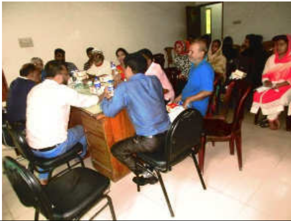
Project Information Disclosure Meeting held at Ward Commissioner Office on 15.05.2018