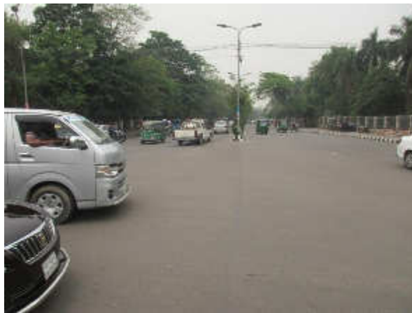
Reconnaissance Survey, TSC to Shahbag Road