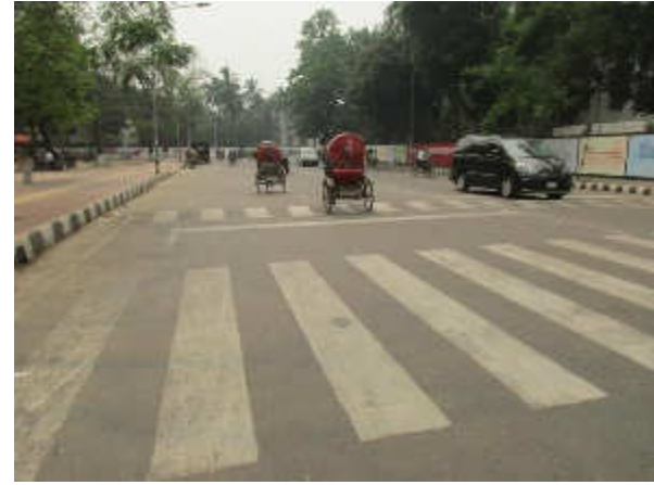
Reconnaissance Survey, Shaheed Minar Area, DMA 616