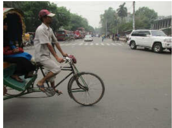
Reconnaissance Survey, High Court Road