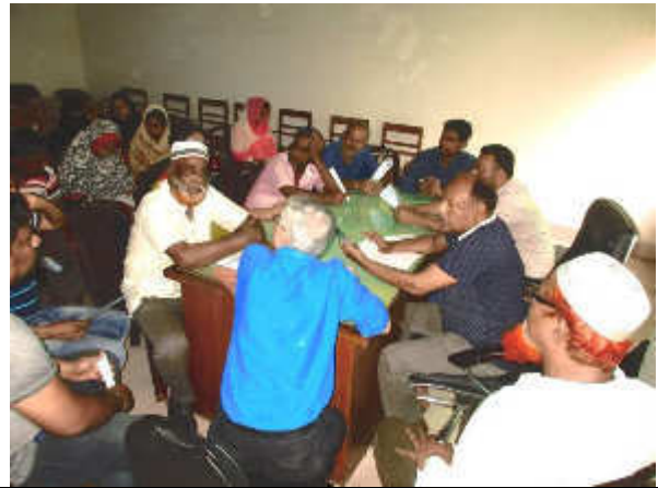
Project Information Disclosure Meeting held at Ward Commissioner Office on 15.05.2018