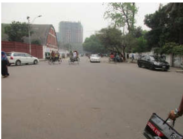
Dhaka Medical to TSC Road, DMA- 616